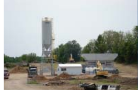
Oneida Lake Ready Mix