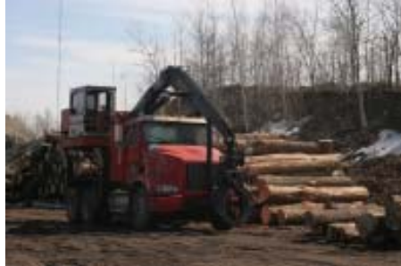
Barnett Forest Products